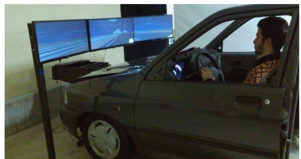
Fig. 2: Driving simulator

two-lane highway with an asphalt shoulder. Each lane measures 3.75 meters in width, and the total road length spans 2.5 kilometers. The speed limit imposed on the route stands at 80 kilometers per hour. Furthermore, all other parameters of the simulated route, including signs and symbols, have been simulated in accordance with those of the actual road. During the driving simulation, a hazardous situation is induced by the entry of a pedestrian into a traffic lane. Figure 3 shows the details of the simulation path. The data collection utilizing this device followed a protocol wherein the participant received preliminary instructions regarding the device. Subsequently, the participant proceeded to operate the device for a period of 2 minutes on a trial basis. Upon attaining familiarity with the device's surroundings, the primary test was initiated. It is worth mentioning that a few participants experienced dizziness during the course of operating the device, while some discontinued the test prematurely. As a result, their test results were deemed invalid and their corresponding data was excluded.